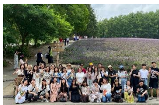
Off Campus Bus Tour

Japanese Class, Japanese Cultural Event, Off Campus Bus Tour, etc.