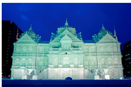
Sapporo Snow Festival