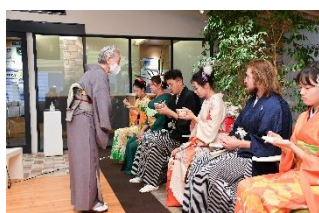
Japanese Cultural Event

For more details, please refer to Program Guide.