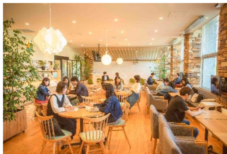
International Communication Center